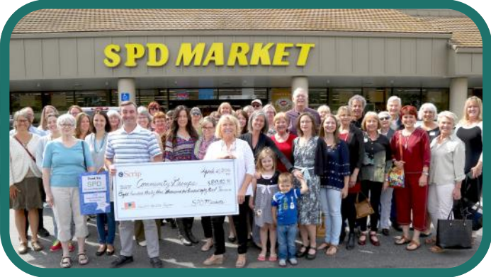
Group photo taken during the eScrip presentation at Grass Valley SPD Market.